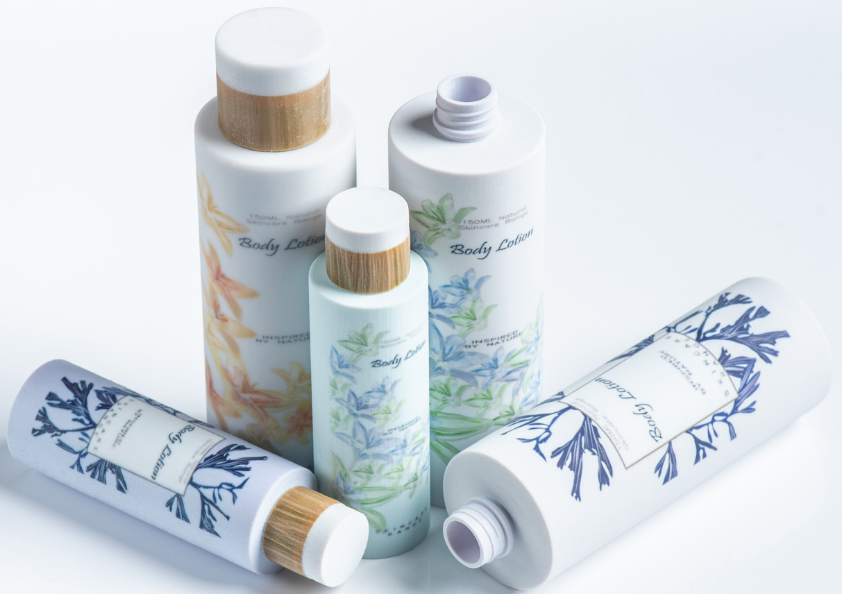
3D Printed in full-color on the J850.