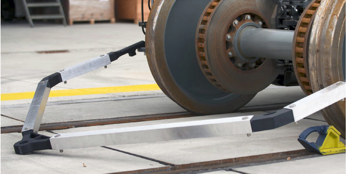
Siemens Mobility is now using its Fortus 450mc to make one-off tools customized to each bogie in a matter of hours.

Kuczmik concluded, “The ability to 3D print customized tools and spare parts whenever we need them, with no minimum quantity, has transformed our supply chain. We have reduced our dependency on outsourcing tools via suppliers and reduced cost per part, while also opening up more revenue streams by being able to service more low-volume jobs cost-effectively and efficiently.”