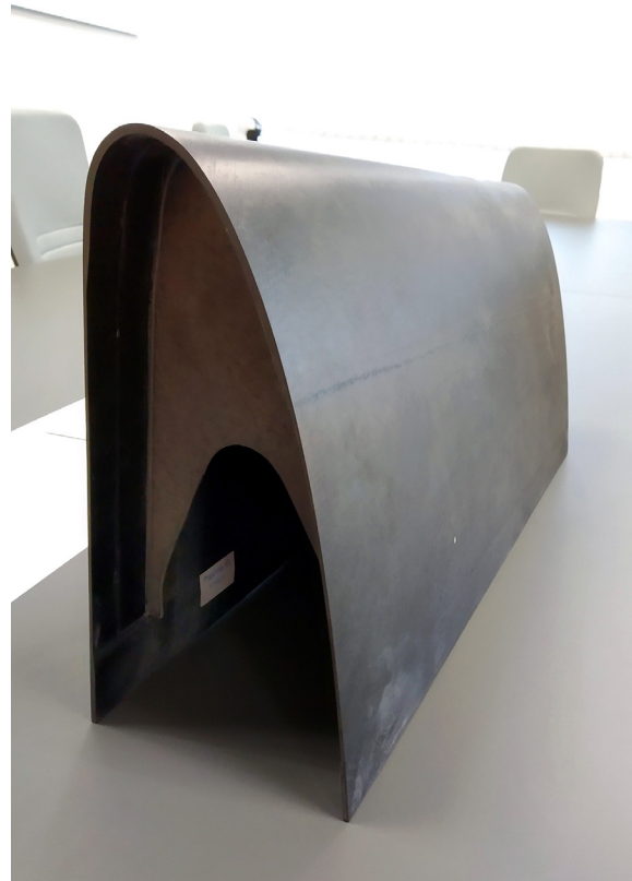
The final composite part of a curved aircraft wing, produced with FDM technology.

The team has also been able to save up to 67% of the costs of CNC machining aluminum, a technical innovation which met the initial objective to reduce manufacturing costs.